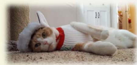
Winter got you down? Brewster feels that way too! He's our ESD Pet of the Qtr. Get ready for spring by taking advantage of the Free Landfill Days!