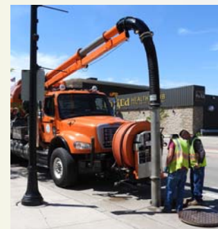
City of Superior Vactor Truck cleans out a grit chamber on Tower Ave.